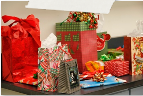
A GAA holiday tradition, exchanging gifts.