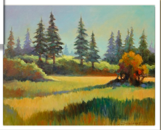
Best of Show: Dulcie Adams