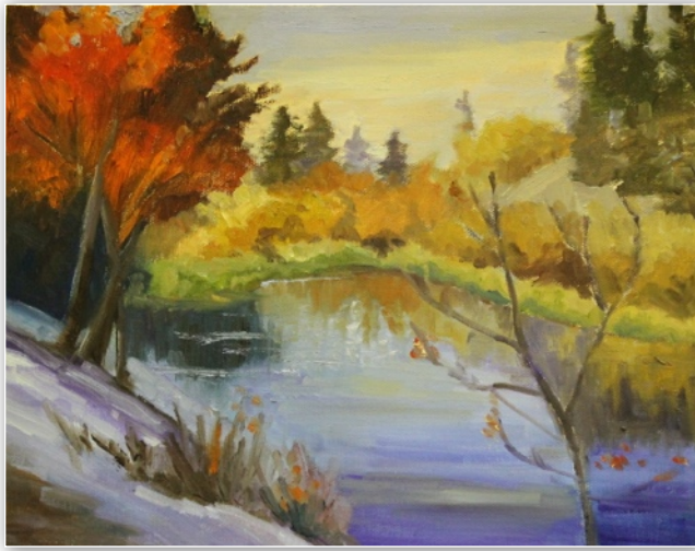
Top left: The demonstration painting created at the December meeting by Trish Kertes.