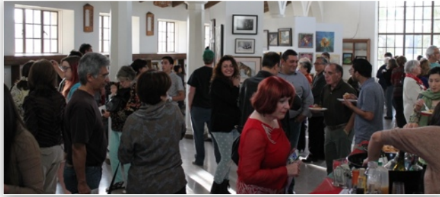
By Michael Sheehan

What a shame that the Holiday Salon could only stay up for four days. The lovely Eagle Rock Center for the Arts adapted nicely for the eclectic installation that featured art and artists of all varieties. The Glendale Art Association continues to encourage a wide range of art styles and media in its shows. The Opening Reception featured a string quartet playing a repertoire of chamber music and pop selections. The exhibition mounted very diverse works side by side, delivering an exciting art exploration that enlivened the opening reception visitors.