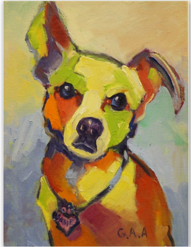
Above: The cubistic style portrait that was created by the members at the December Association meeting