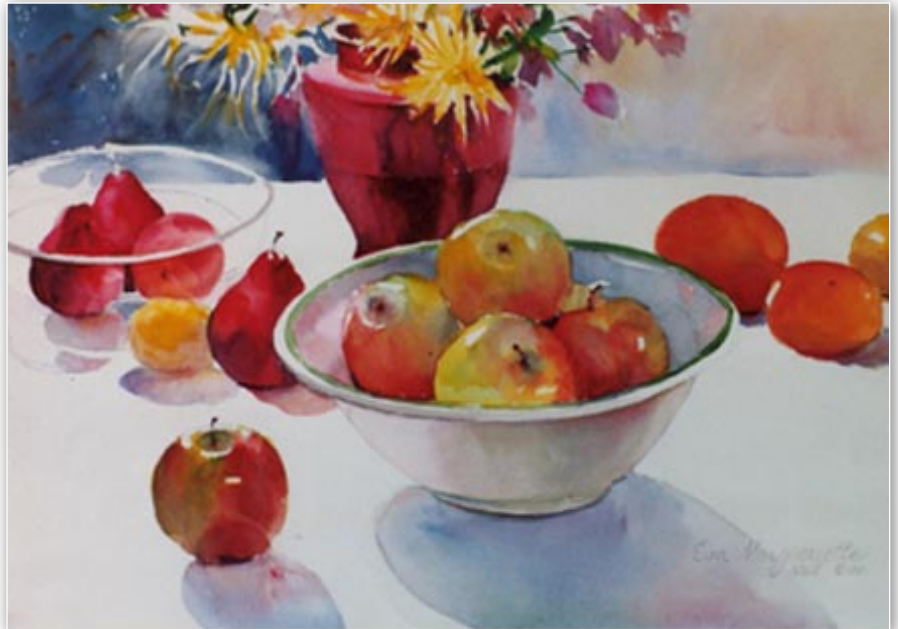
Apples and Oranges | Watercolor, 20" x 15"

Juried exhibits include: Watercolor West, The American Watercolor Society at the Salmagundi Club, New York City, Art Matters at the Huntington Library in San Marino and CAC Gold Medal Exhibition at the Pasadena Museum of California Art. She has won Best of Show and Best Portrait in Pasadena's all-city juried competition and has been awarded hundreds of private and corporate commissions.