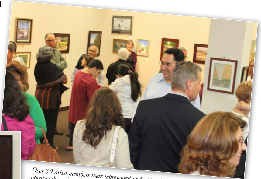
Over 30 artist members were represented and approximately 150 visitors attended the opening throughout the evening

We would also like to thank all of our members who made beverage donations for the reception and to those of you who will be sitting at the gallery during open hours for the run of the show. Thank you!