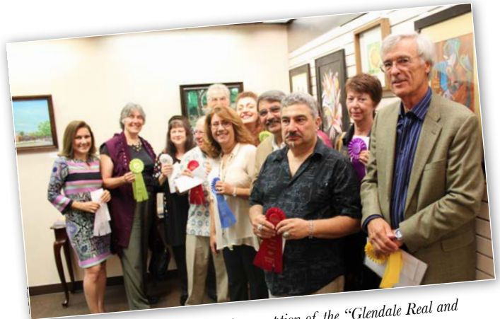
Above: Award winners at the opening reception of the "Glendale Real and Imagined" show at Anzoh Art Gallery.