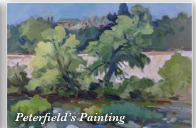
The above images were taken at the April paint outs at the Los Angeles River and the Arboretum. See page 3 for the upcoming paint out schedule.