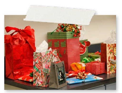
A GAA holiday tradition, exchanging gifts.