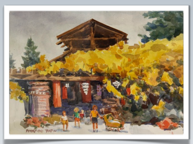
Best of Show: Peter Turpin