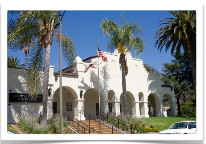
Sparr Heights Community Center, our new meeting location, is conveniently located at 1613 Glencoe Way, Glendale.

the perfect accompaniment for our Spring Salon reception,