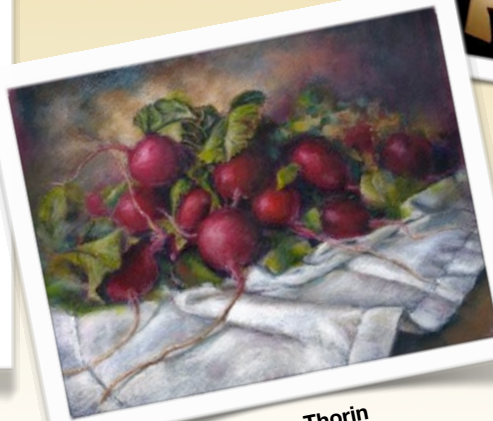
Radishes