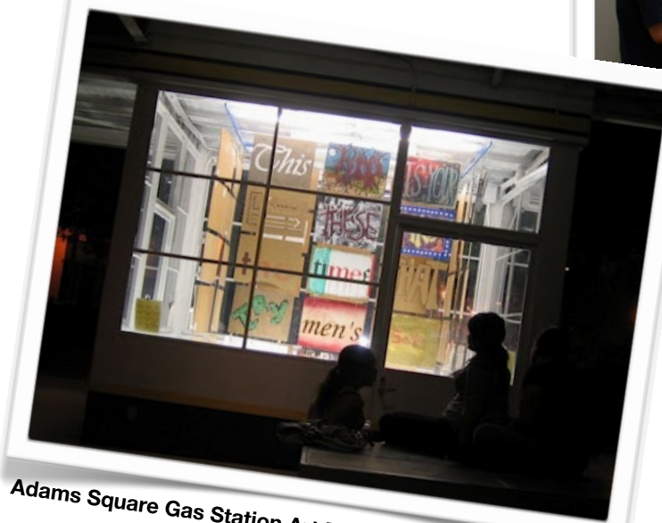
Adams Square Gas Station Art Project