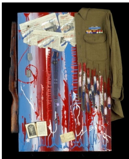
The Universal Soldier