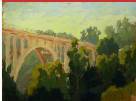
"Colorado Boulevard Bridge, Pasadena", pastels