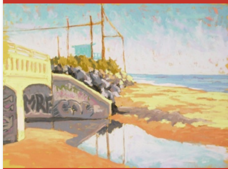
"Corral Beach, Malibu", pastels