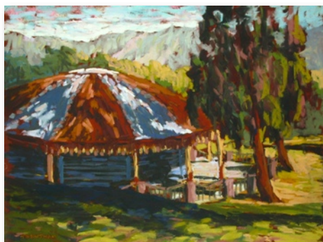
"Merry-Go-Round, Griffith Park", pastels